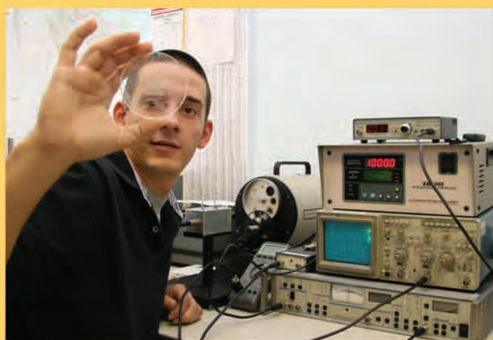
Associate Degree in Electrical Engineering, specializing in Robotics and Photonics

IRSC also offers Associate Degree programs for university transfer and career preparation in over 100 career fields including health care, technology, business and public service.